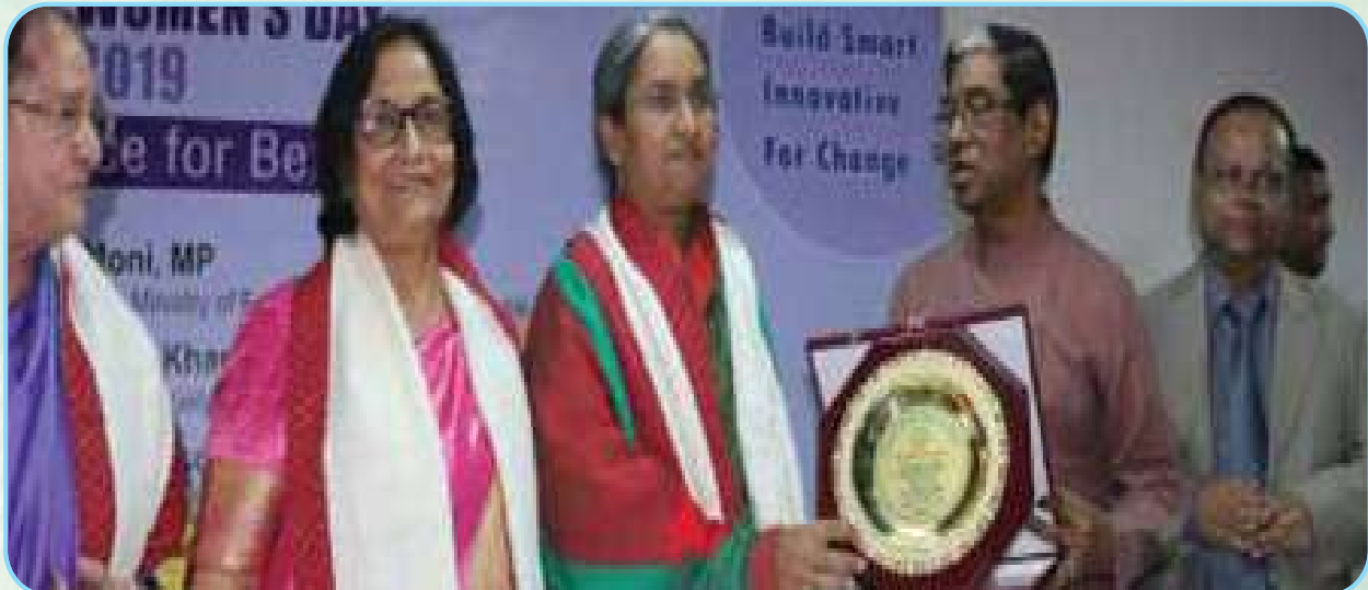
Prof. Pran Gopal Datta is offering a crest to Dr. Dipu Moni, Hon'ble Minister, Ministry of Education, Govt. of People's Republic of Bangladesh during celebration of International Women's Day 2019