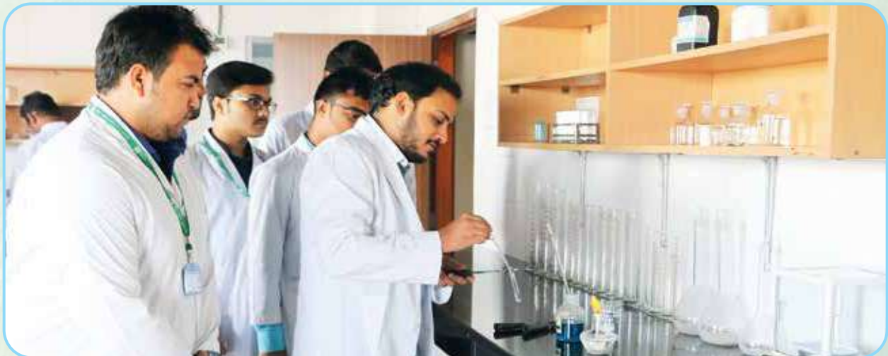
Biochemistry Practical Class