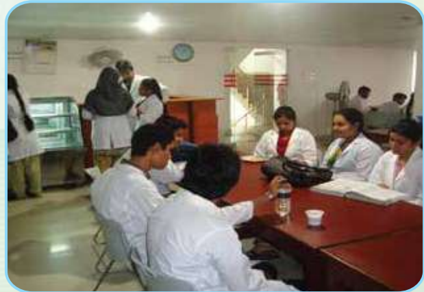
Students in the Cafeteria