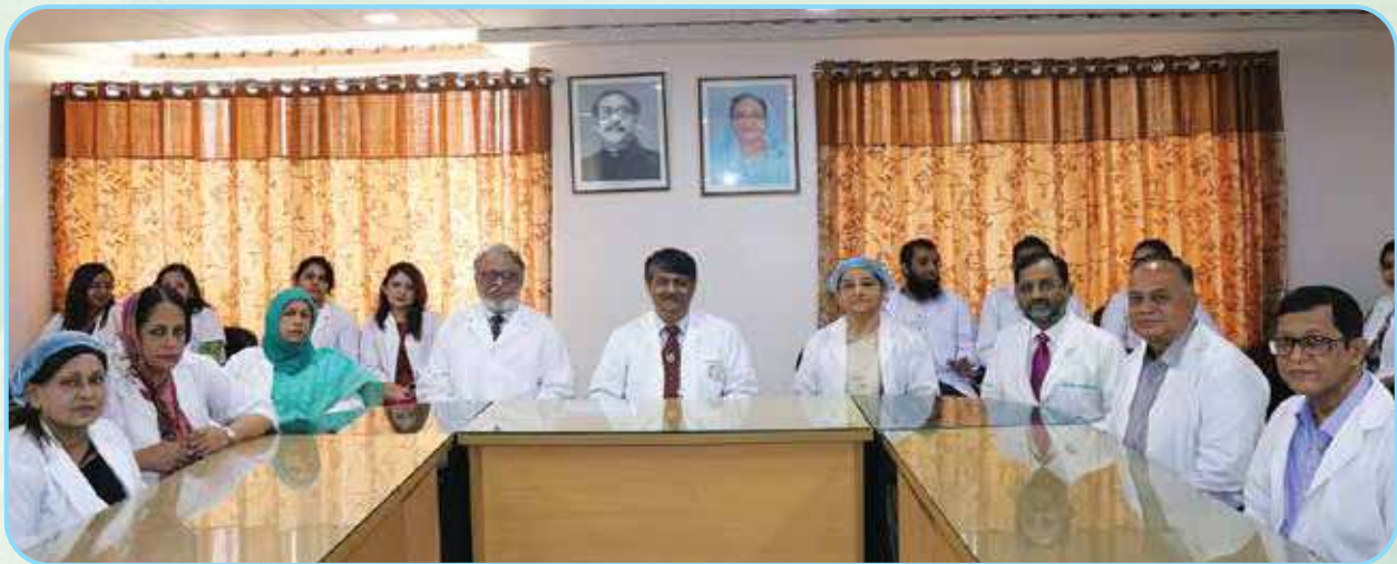
Principal with Faculty Members in daily morning meeting