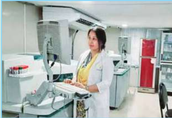
Clinical Biochemistry Laboratory