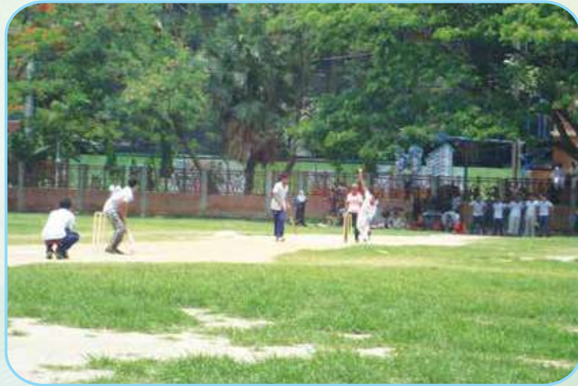
Final cricket match between Barisal Tigers and Dhaka Jaguars in Green Life Medical College Premier League

Students are encouraged to participate in extra-curricular activities under the banner of college along with teachers.