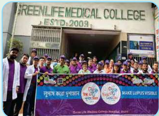
Celebrating World Lupus Day