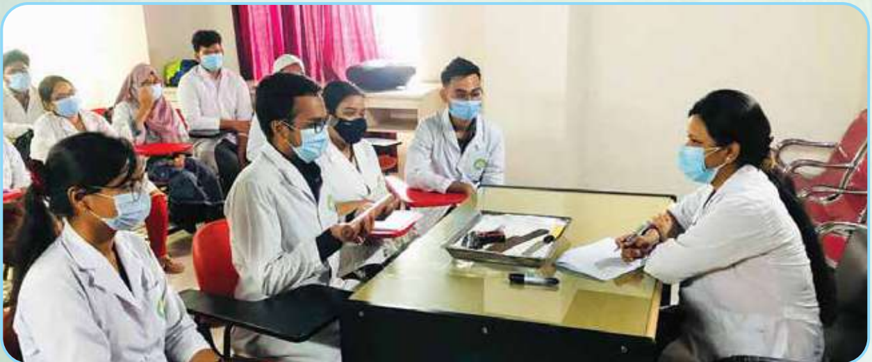
Forensic Medicine Practical Class