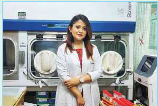
PCR and Molecular Laboratory