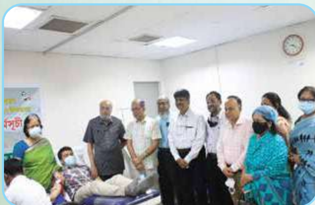
Blood Donation Program