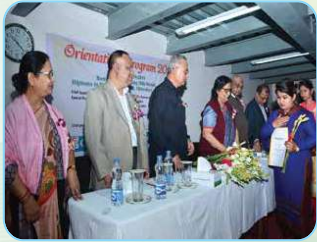
Capping Ceremony & Orientation Program of New Nursing Students