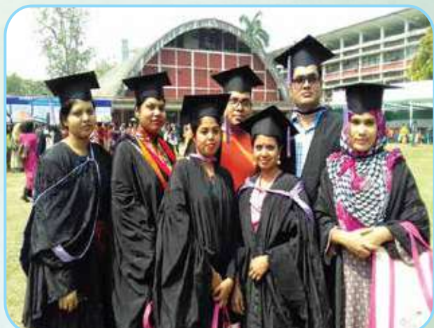
Part of the graduate nurses of this college who participated in the convocation ceremony of Dhaka University