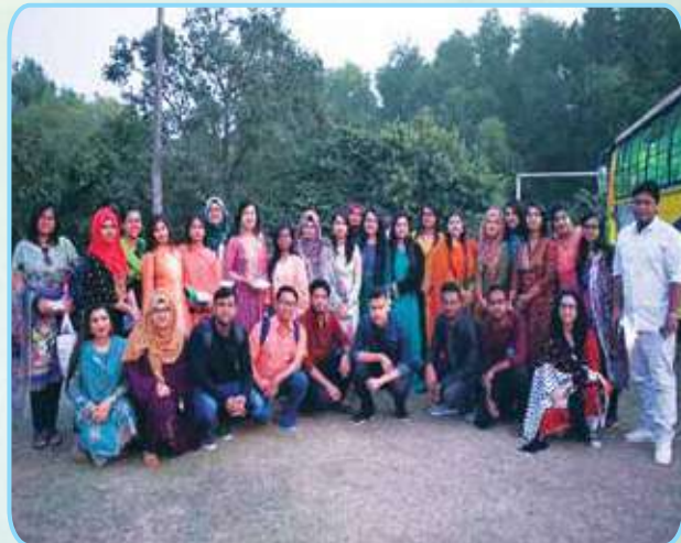
Green Life Medical College Annual Picnic 2020