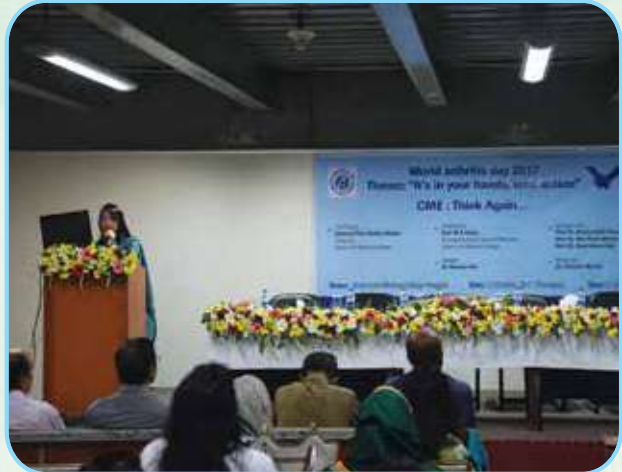
CME on World Arthritis Day