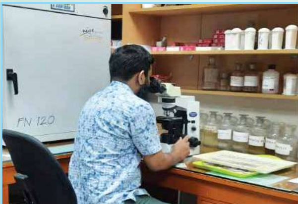
Histopathology and Cytopathology Laboratory