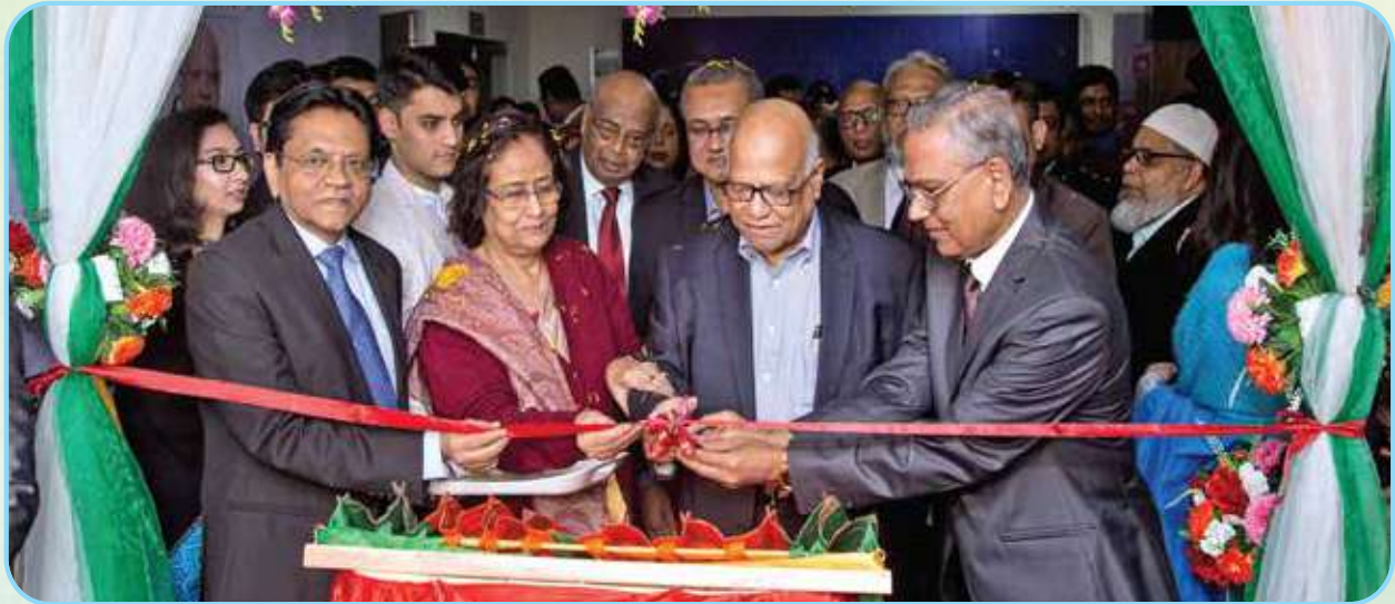
Mr. Abul Maal Abdul Muhith, the then Honorable Finance Minister of People's Republic of Bangladesh inaugurated the newly-led College building of Green Life Medical College