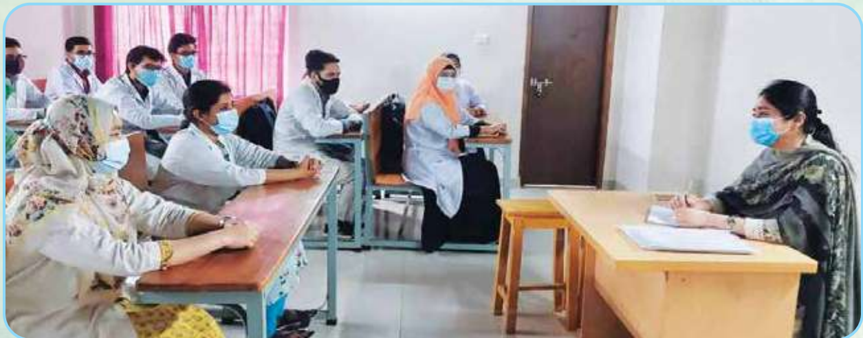
Pathology Practical Class