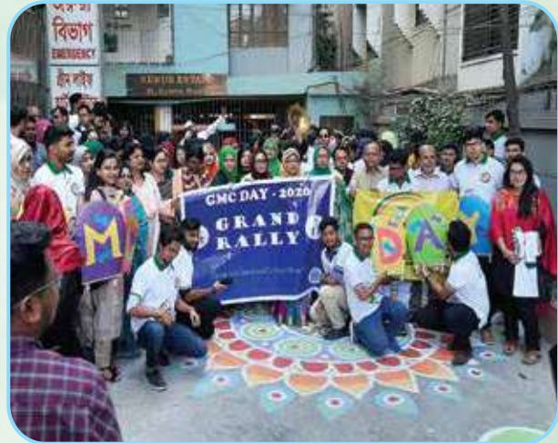
GMC Day Celebration, 2020