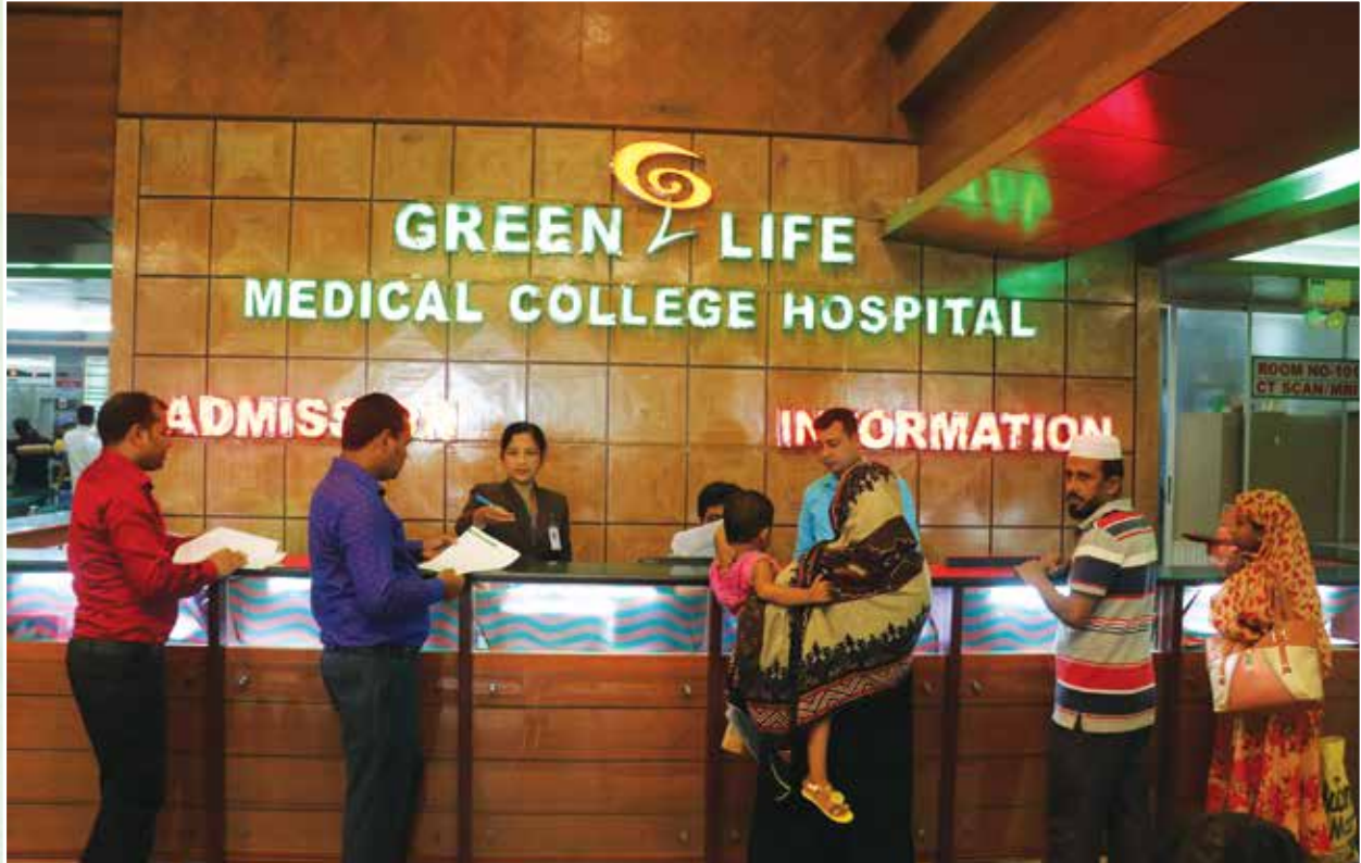
Green Life Medical College Hospital Reception