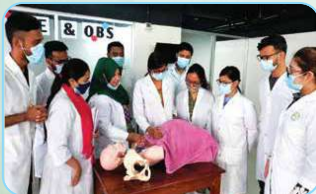
Obstetric Tutorial Class