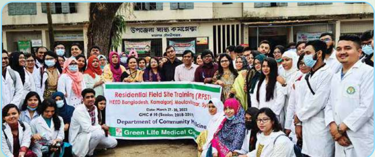
Community Medicine Residential Field Site Training