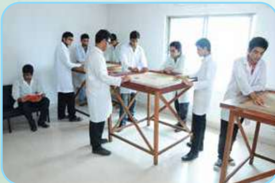
Boys Common Room