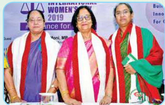
National womens day