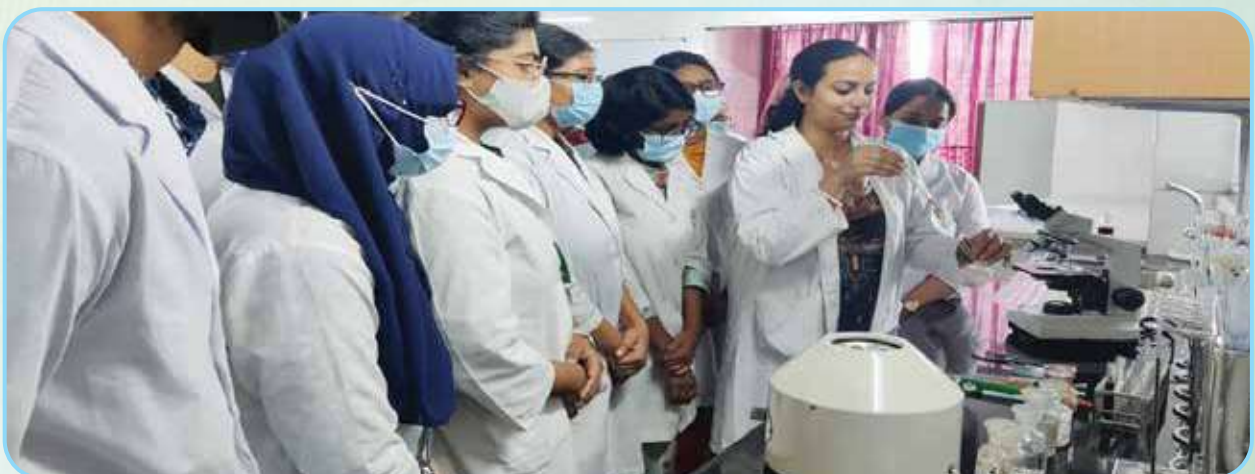
Physiology Practical Class