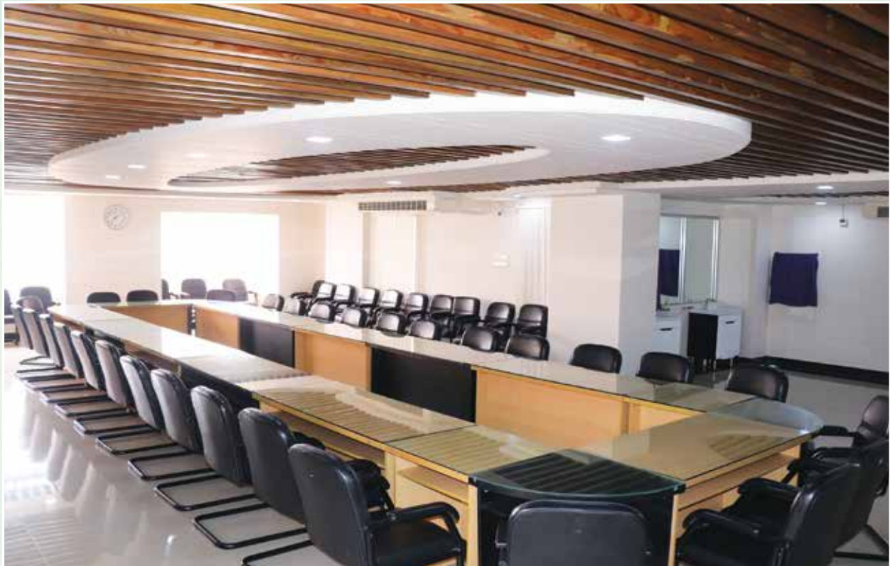
Conference Room of Green Life Medical College