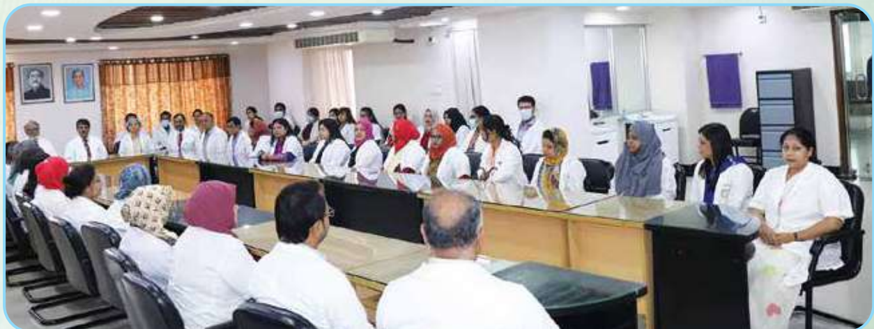
Principal with Faculty Members in daily morning meeting