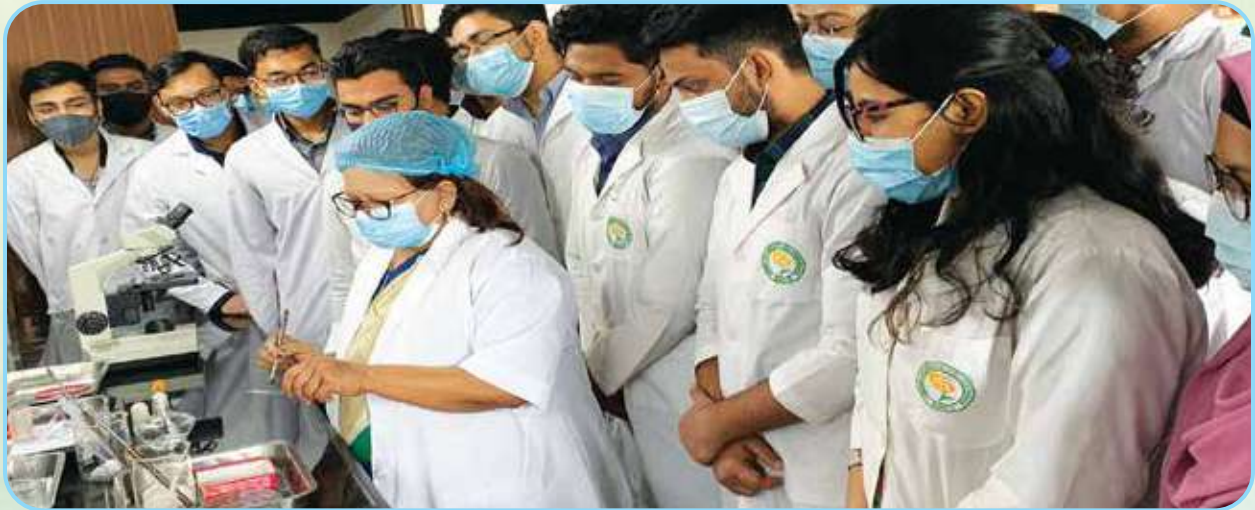
Microbiology Practical Class