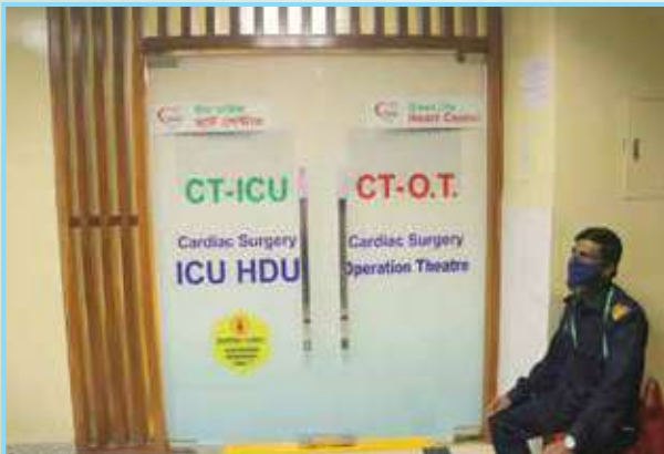
GMCH Heart Centre