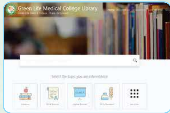
Green Life Medical College Digital Library