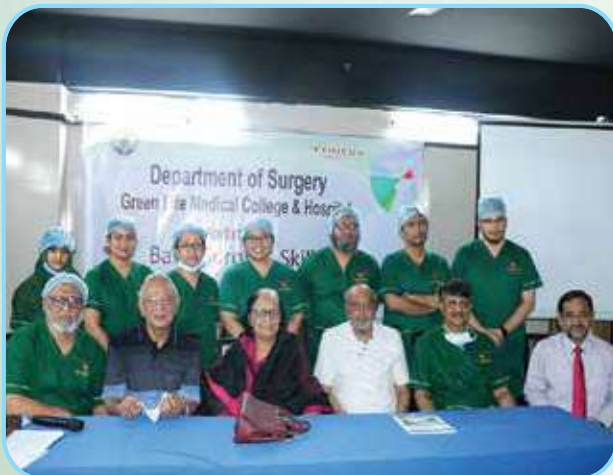
Basic Surgery Skills Training Program