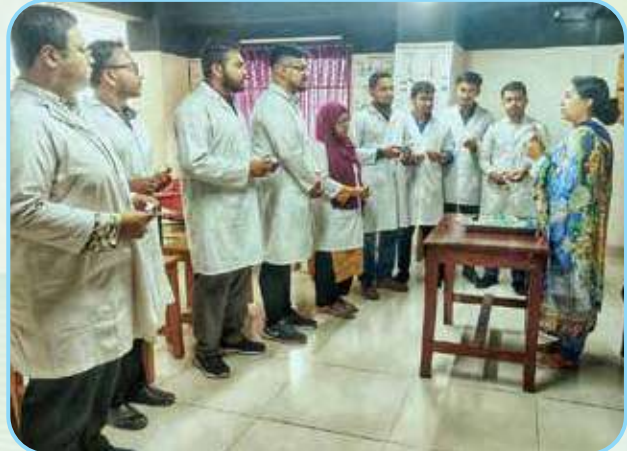
Pharmacology Practical demonstration class