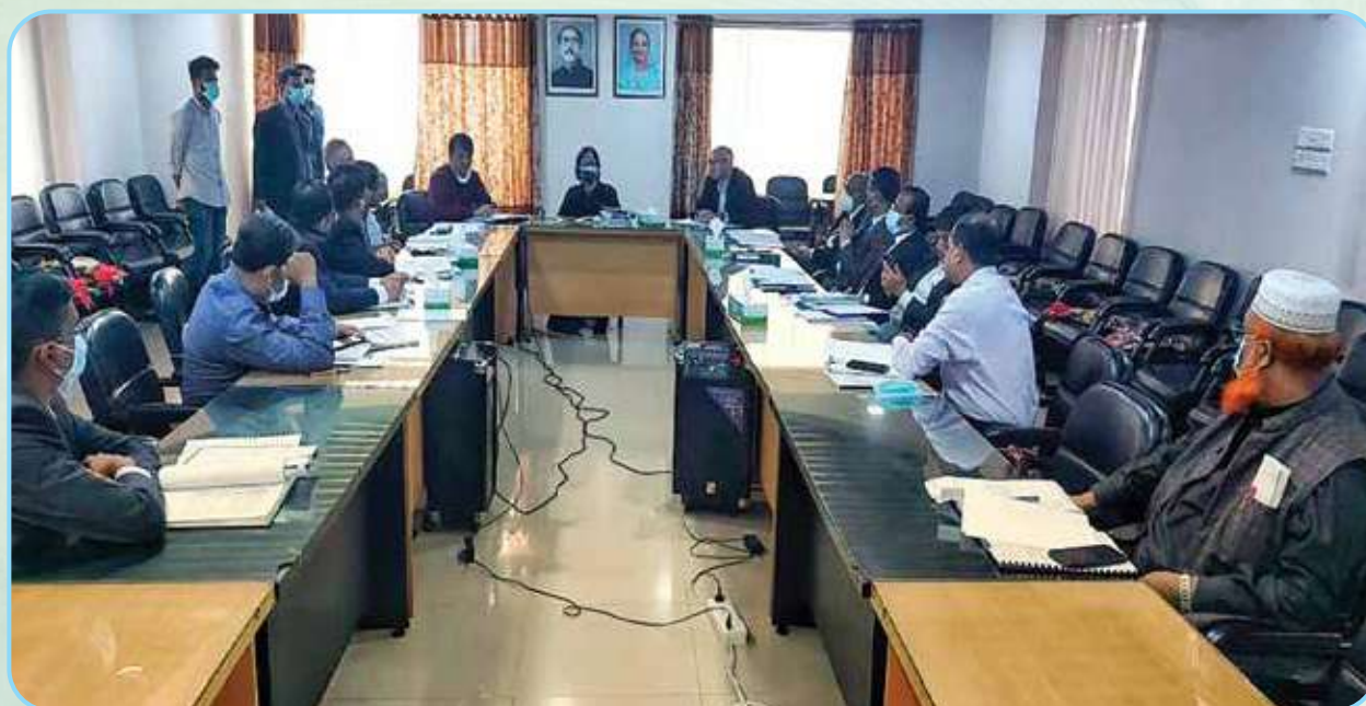
Governing Body Meeting in GMC