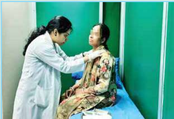
Cytopathology Lab (FNAC Procedure)