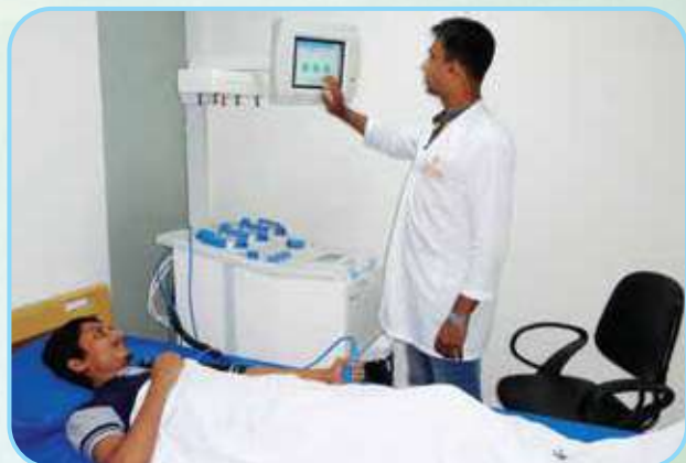
Department of Blood transfusion