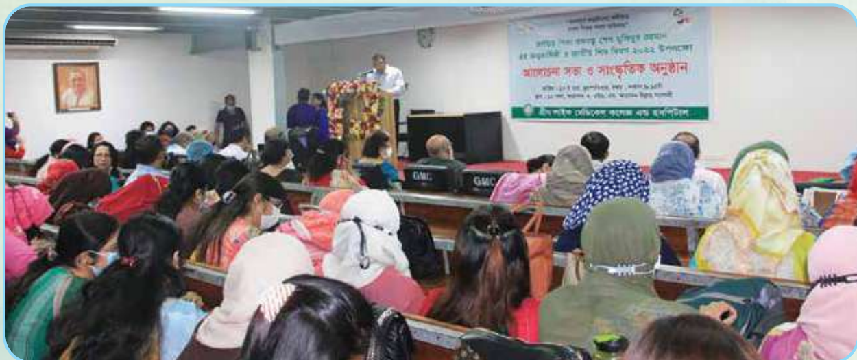
Celebration of Father of the nations birthday (17th March & National Children's Day)