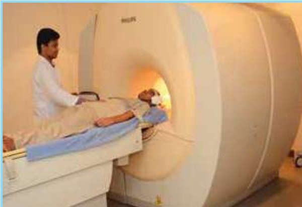
Radiology and Imaging: MRI