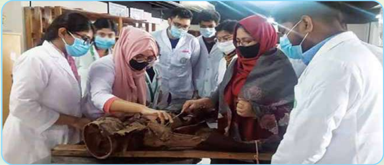
Anatomy Dissection Class