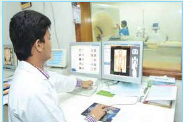
Radiology and Imaging: CT Scan