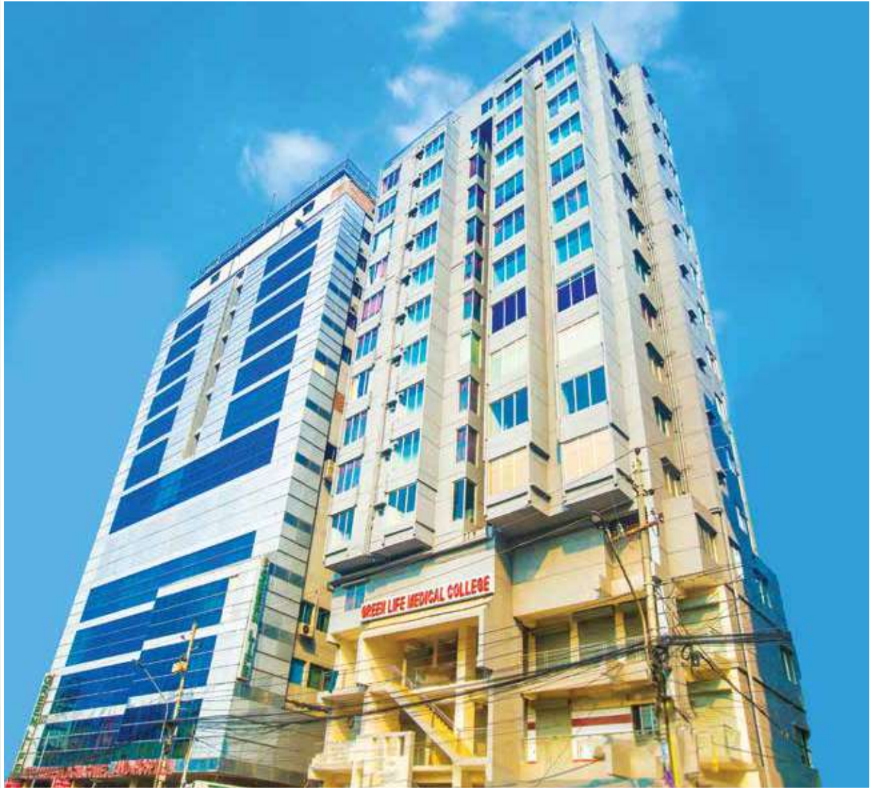
Green Life Medical College Hospital