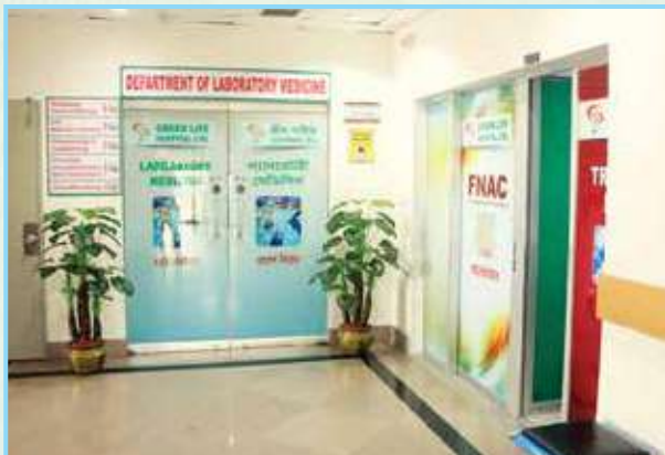
Pathology & Molecular Lab