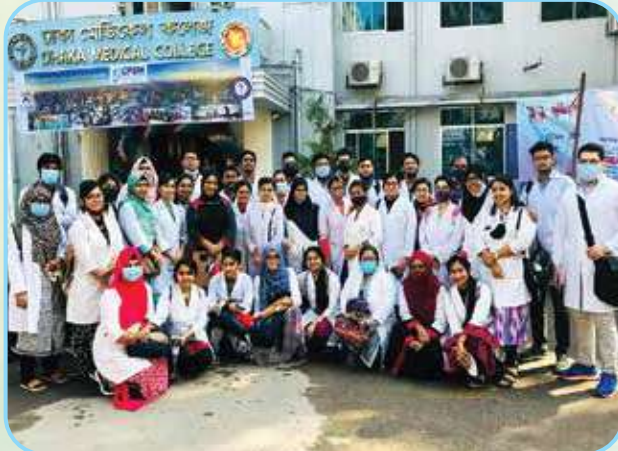
Morgue visit of DMC by Department of Forensic Medicine