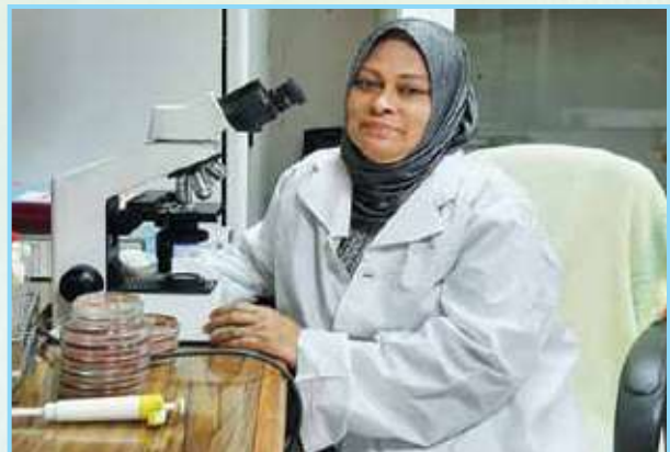
Clinical Microbiology Laboratory