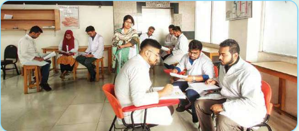
Pharmacology and Therapeutics Practical Class