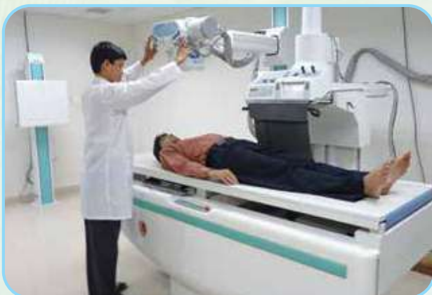
Department of Radiology and Imaging