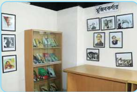
Mujib Corner at GMC Library

Library has the access to HINARI; which is a research database in Health Programme set up by the World Health Organization and major publishers to enable developing countries to access collections of biomedical and health literature.