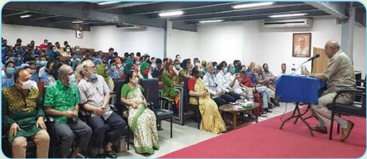
Celebration of Independence Day (26 th March)