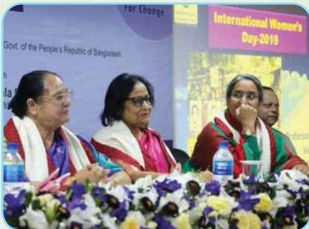
International Women's Day 2019 celebration