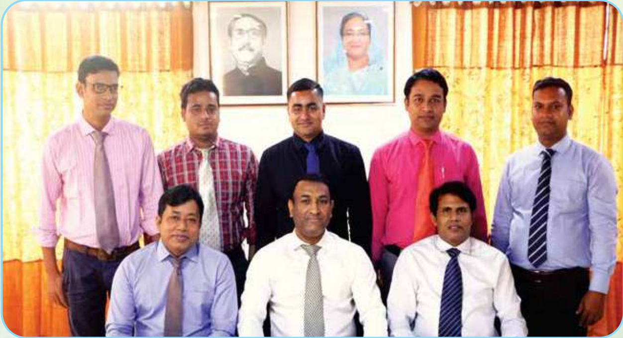
Administrative staffs of Green Life Medical College